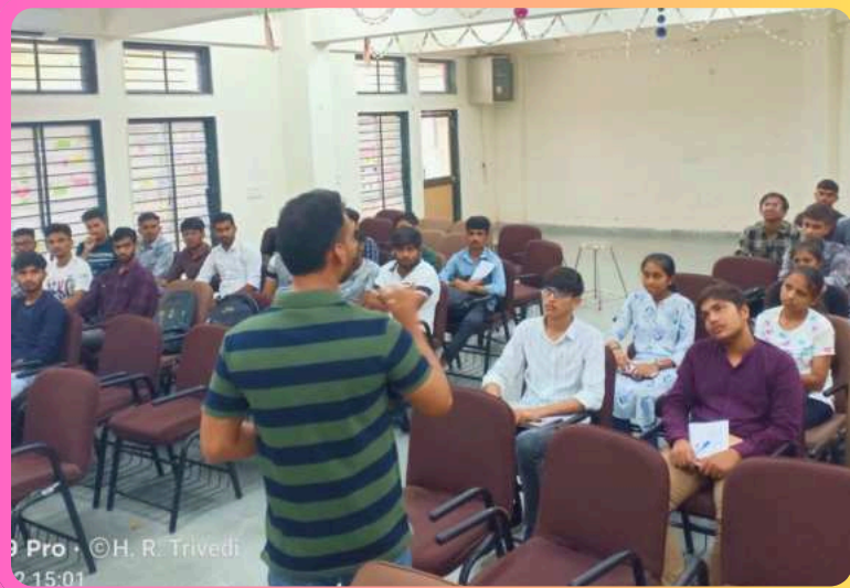
PPO F9 Pro · ©H. R. Trivedi 24/08/24 15:01

As the workshop was aimed to expand the knowledge of the students about the Drafting and 3D Modeling of structures using AutoCAD and Sketch-up software tools by allowing exchanges of views between Expert Personals of SAICAD & students and we collectively meet the requisite of the event successfully at the end of day. Participants were participated with great enthusiasm and enjoyed the benefit of the workshop.