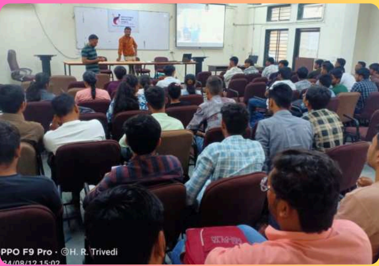
PPO F9 Pro · ©H. R. Trivedi 24/08/24 15:02

The workshop was held at "Civil Seminar Hall" of GAE-Patan, on 12th August 2024, aimed at driving forward knowledge in students about the Drafting and 3D Modelling of structures using AutoCAD and Sketch-up software tools and allowing exchanges of views between Esteemed Industrial Experts of SAICAD and Civil Engineering Students of GEC-Patan. The workshop was attended by 40 participating students of Civil Engineering department of GEC-Patan and got benefit of the same.